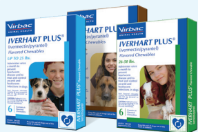
IVERHART PLUS® (ivermectin/pyrantel) Flavored Chewables