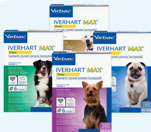
IVERHART MAX® Chew (ivermectin/pyrantel pamoate/praziquantel)