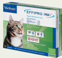
EFFIPRO Plus® Topical Solution for Cats