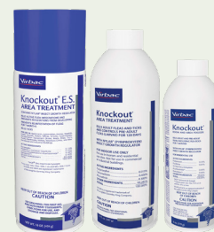
KNOCKOUT® Brand Products

CATEGORY C EFFIPRO® and EFFITIX® products must be purchased in displays. Purchase five (5) skus mix-and-match across all brands, RECEIVE one (1) sku FREE. Purchase ten (10) skus mix-and-match across all brands, RECEIVE three (3) skus FREE.