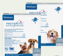
PREVENTIC® TICK COLLAR FOR DOGS