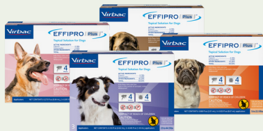
EFFIPRO Plus® Topical Solution for Dogs

CATEGORY B SENERGY™ Brand products must be purchased in displays. Purchase five (5) displays mix-and-match across SENERGY Brands, RECEIVE one (1) display FREE. Purchase ten (10) displays mix-and-match across SENERGY Brands, RECEIVE three (3) displays FREE.