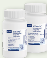
Virbantel® (pyrantel pamoate / praziquantel) Flavored Chewables