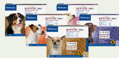
EFFITIX Plus® Topical Solution for Dogs